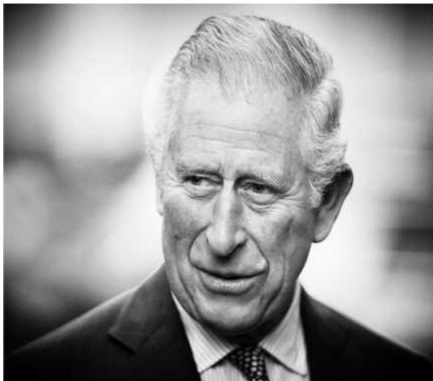
King Charles III